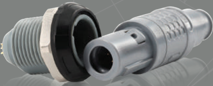
PUSH PULL - SER. M

PalPilot has a long history of manufacturing electrical connectors. Our connectors are designed for Medical, E-mobile, Military, Industrial and Instrumentation. Who better to terminate the connector and cable than PalPilot ! Our custom over molds, and in-house tooling allow us to manufacture assemblies with high mix-low volumes in short delivery times.